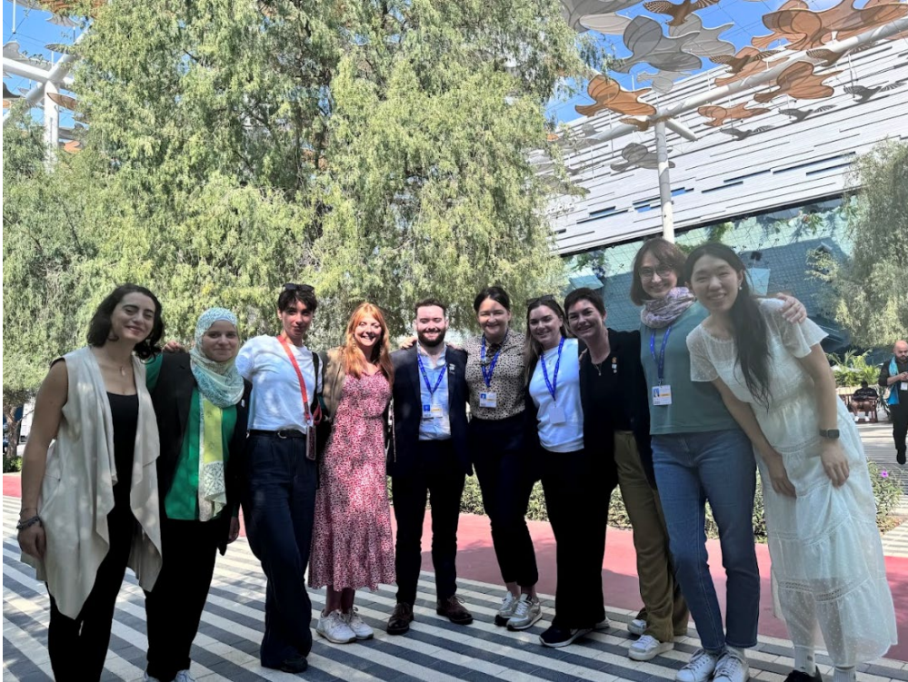
Pictured above: WorldGBC team at COP28.

It's now been a couple of days since the UAE COP28 negotiations finally closed and the world's first Global Stocktake concluded.